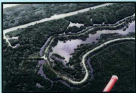
These juveniles live in stagnant, swampy marshes at the upper reaches of Florida's estuaries