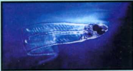
Transparent larvae live in the open ocean