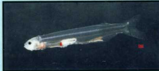
In the estuary, they metamorphose into 3/4"- long juveniles