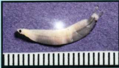
1"- long larvae migrate to inlets (hurricanes and storms can help them!)

The rings in their ear bones (otoliths) indicate they move onshore after about 20 days. These "diaries" indicate that adults spawn during full moon periods in summer