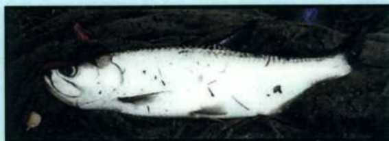
After 1 year in the marsh, 12"- long tarpon move into coastal rivers and lagoons

The Florida marshes are THE ONLY nurseries for tarpon in the U.S.